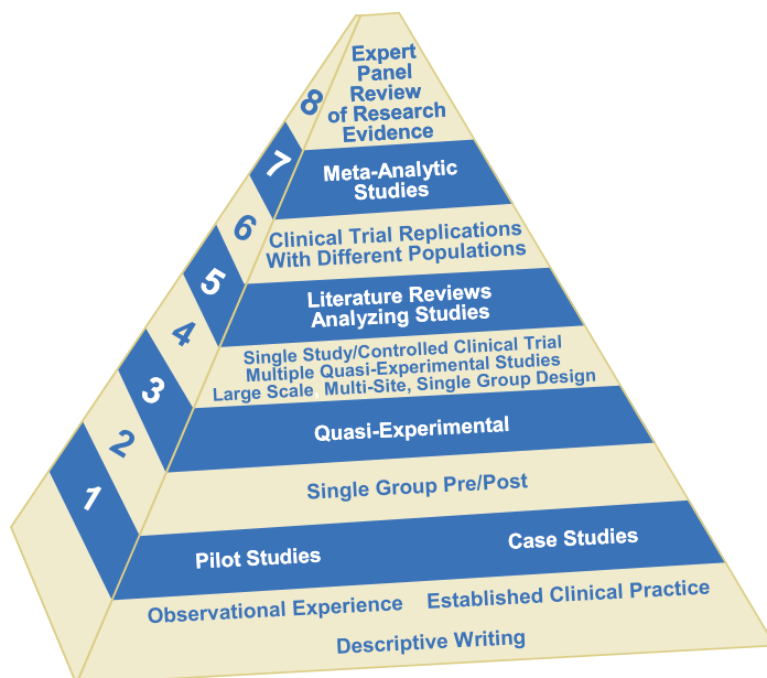
Figure 2: Pyramid of Evidence-Based Practices

The key question in determining whether a practice is evidence based is: What is the strength of evidence indicating that the practice leads to a specific clinical outcome? There is no gold standard for assessing strength of evidence, especially evidence derived from clinical experience. However, COCE has developed a pyramid to represent the level or strength of evidence derived from various research activities. As can be seen in Figure 2, evidence may be obtained from a range of studies including preliminary pilot investigations and/or case studies through rigorous clinical trials that employ experimental designs. Higher levels of research evidence derive from literature reviews that analyze studies selected for their scientific merit in a particular treatment area, clinical trial replications often with different populations, and meta-analytic studies of a body of research literature. Finally, at the highest level of the pyramid, are expert panel reviews of the research literature.